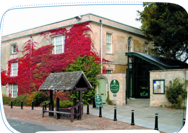
Oxfordshire Museum Woodstock

The council supports the collection, preservation and care of Oxfordshire’s heritage directly through four cultural venues: the Oxfordshire Museum in Woodstock, the Oxfordshire History Centre in Cowley, the Museums Resource Centre in Standlake (housing the reserve collection and outreach service) and Swalcliffe Barn near Banbury. The History Centre is the designated Diocesan Record Office for Oxfordshire, which preserves and makes available records of parishes, the Oxford Archdeaconry and Oxford Diocese.